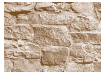
Stone Veneer: Natural Stone