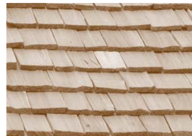
Roof: Heavy Treated Hand-Split Cedar Shake Shingles