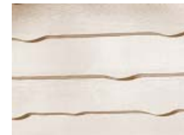
Accent Siding: Wavy-edge Cedar Siding