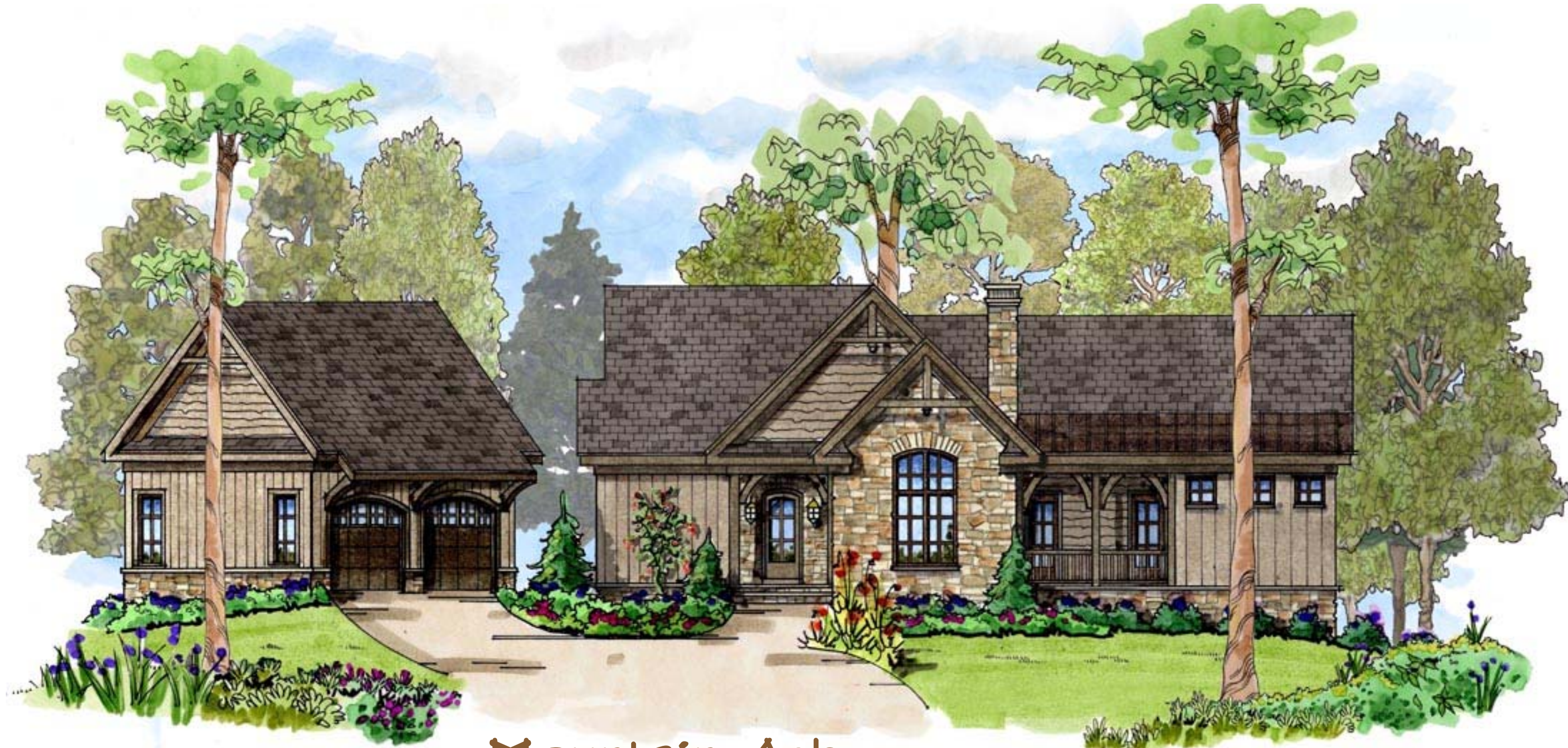
Mountain Ash FRONT ELEVATION