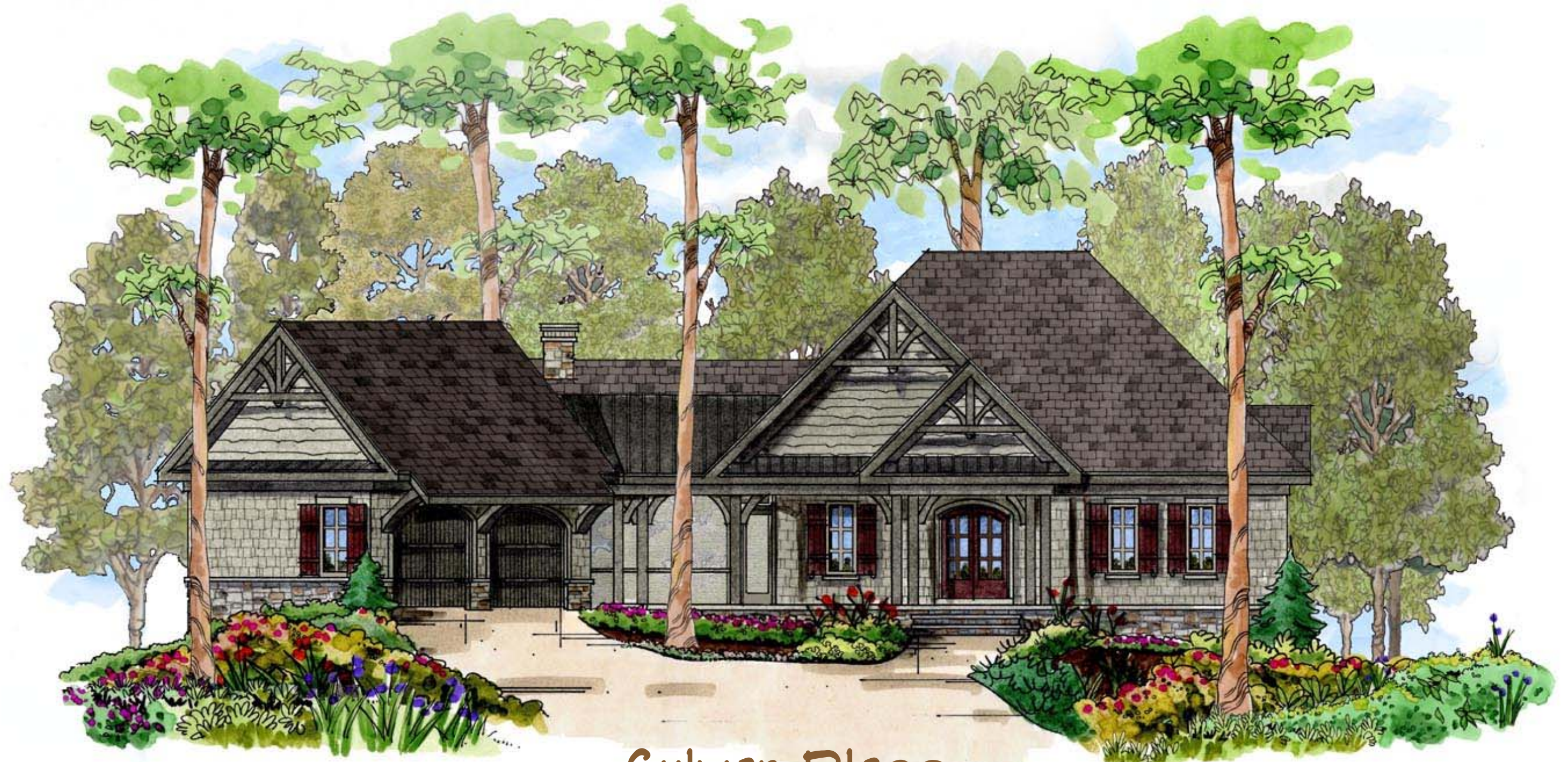
Sylvan Place FRONT ELEVATION