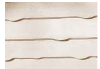
Accent Siding: Wavy-edge Cedar Siding