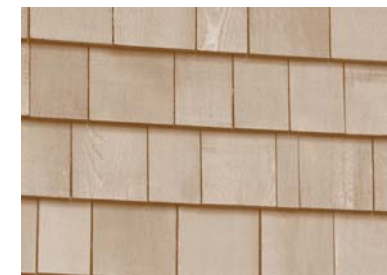
Wall Siding: Cedar Shingle Siding